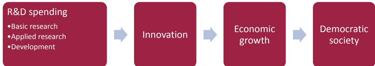
Fig. 1: Schematic depiction of the innovation policy narrative

“social fact” partly because it is so entrenched in statistics (Godin 2009, 27). Similarly, while there are reasonable doubts about the underlying assumptions of the narrative (Wladawsky-Berger 2018), and attempts to come up with alternatives (Nowotny 2016), it seems fair to say that the innovation policy narrative remains convincing for policy makers thus far.